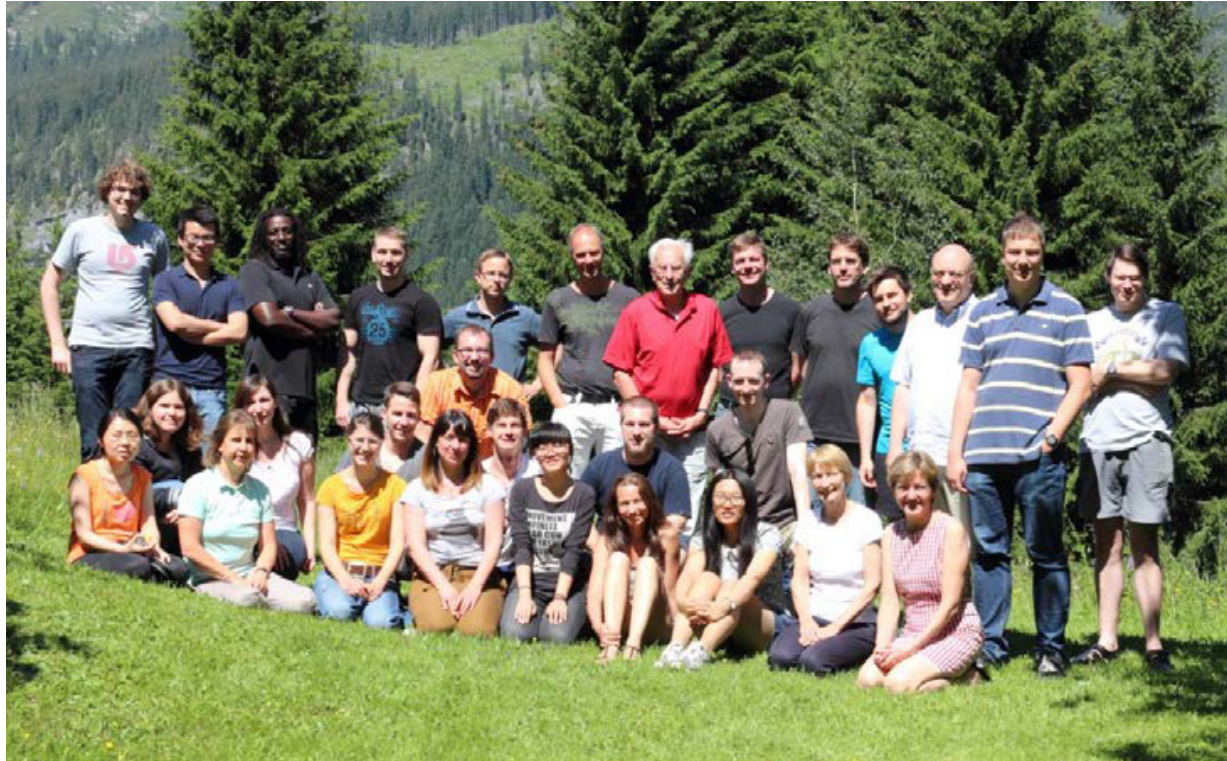
Group photo of the 5th SALVE Workshop in Hirschegg, Kleinwalsertal

To further ask questions is the best way for getting deeper and deeper understanding and improved knowledge! On the next, the 6th, SALVE workshop we will present proof of our theoretical and experimental evaluation by showing relevant results obtained with the completed SALVE-TEM.